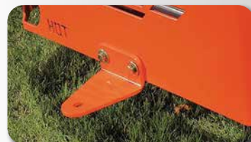
BOLT ON HITCH