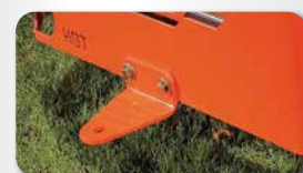
BOLT ON HITCH