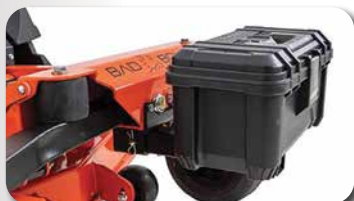
FRONT MOUNT TOOL BOX