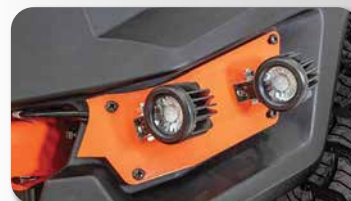
LED TANK LIGHT KIT