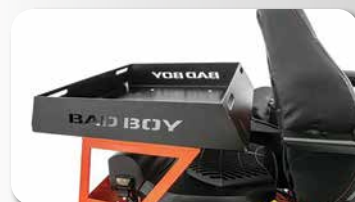
REAR MOUNT BASKET