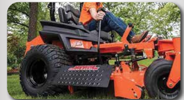
ADVANCED CHUTE SYSTEM