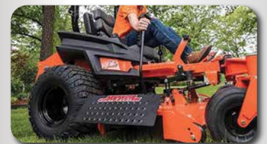
ADVANCED CHUTE SYSTEM