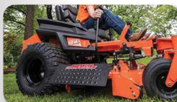
ADVANCED CHUTE SYSTEM