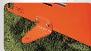
BOLT ON HITCH