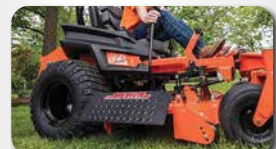
ADVANCED CHUTE SYSTEM