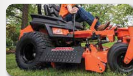
ADVANCED CHUTE SYSTEM