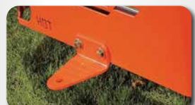
BOLT ON HITCH