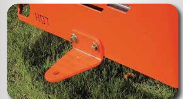
BOLT ON HITCH