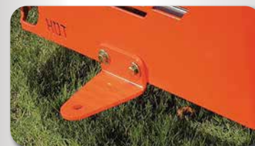
BOLT ON HITCH