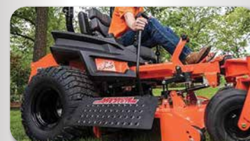
ADVANCED CHUTE SYSTEM