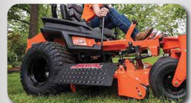
ADVANCED CHUTE SYSTEM