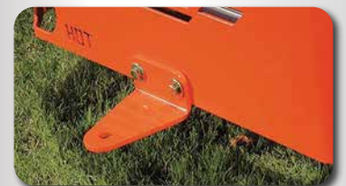
BOLT ON HITCH